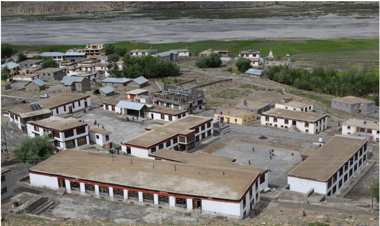
A fine sunny day at Munsel-ling Campus (foreground)

Munsel-ling School is now certified to educate young students of all ages, from kindergarten up to the end of their school careers, and all in one campus! It has won recognition by the Himachal Pradesh Education Board as a senior secondary school, so students can study all the way up to their final 12th grade examinations there; in India these are the 10+2 exams (age 18). A long-term effort to upgrade school infrastructure, to recruit teachers with the higher educational qualifications required and to finance their higher salaries has at last born fruit.