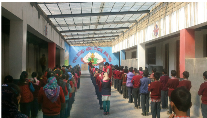
Hello Sunshine! The plastic roof at Rewa Model School provides both light and protection from the elements

At Rewa Model School, Rongtong, where Tibethilfe Niederosterreich (Austria) has helped so much, we installed a clear plastic roof between the two long buildings. This will mean less snow clearing in winter and it makes a warm space on sunny days where children can sit and even take lessons.