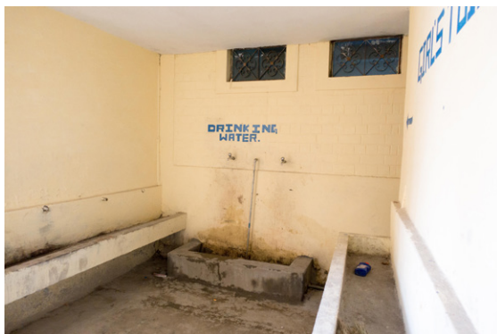
Students now have easier access to fresh drinking water at our hostel in Sidhbhari

of Kangra. Wide, verdant and mountain-fringed, Kangra Valley is one of India's fairest vales. This winter descent from Spiti has been a real benefit to the children's studies, so the 8th class will join them for a spell in the new year too.