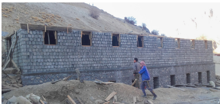
The new multi-season toilets at Munsel-ling School are of utmost importance to our ever growing student population

With help from the University of British Columbia, and the Trans-Himalayan Aid Society (Canada), we built another new children's toilet block this year. It contains flush toilets for warmer weather and drop latrines for frozen winter, a combination pioneered in 2014 in order to improve health and hygiene.