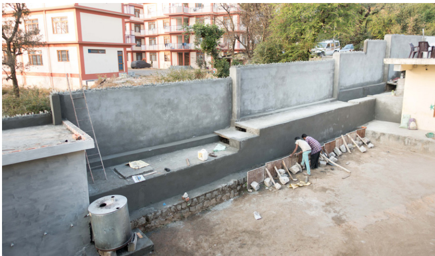
A new boundary wall surrounds our hostel, offices and classrooms in Sidhbhari

At Sidhbhari we have been building a boundary wall and we have made refurbishments and renovations, improving the drinking water and converting a hall into more classrooms. These classrooms are for the 9th, 10th and 11th class students, seventy-two of them, who have again arrived on winter migration. They revise for their exams in a warmer clime and with help from the expert teachers more easily found in the more populated and developed district