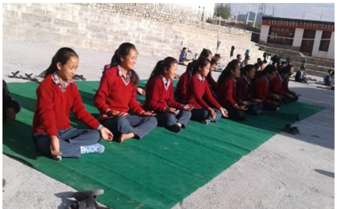
Munsel-ling students practicing yoga in the Himalayan sun

The school site received a thorough clean up from the pupils on 2nd October, 'Mission Clean India' day. Indian Independence Day and Children's Day were commemorated as usual. A novel occasion for the school was the marking of International Yoga Day, 21st June, with teachings and practice of India's unique system of mental and physical wellbeing.