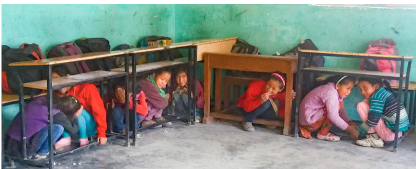
Prepare for the worst, hope for the best. Students practicing what to do in the event of an earthquake

And yet another important day came when a team of police and other officials visited to give training and drills in Disaster Management. Earthquake is one type of disaster that it is necessary to prepare for in this district of young and still growing mountains.