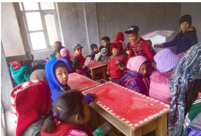
Students testing the new furniture at Kaza Public School

We also thank the Khyentse Foundation for paying for new classroom furniture for Kaza Public