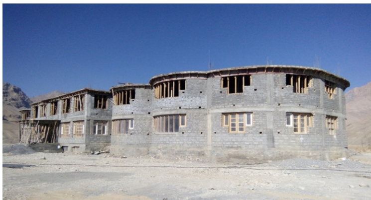
The Kaza Public School, now in the final stages of completion