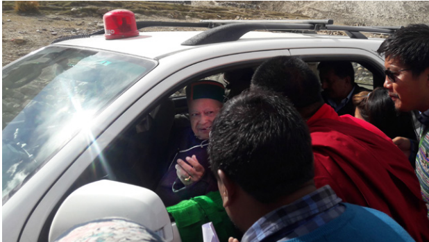
Himachal Pradesh Chief Minister, Virbhadra Singh, on his departure from Munsel-ling School