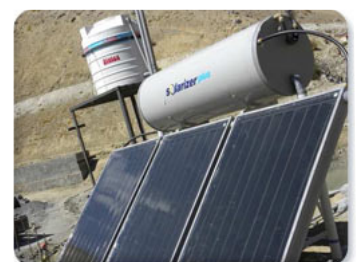
These low tech wonders really take the chill out.

UBC have continued their great support to us in other ways. Student teams visited us in June and July again, doing ongoing health screening, monitoring haemoglobin levels, providing lice and scabies treatments, promoting dental hygiene, and working on water supply, water purification and sanitation issues, as well as being heavily involved in our greenhouse project. They are really helping us to foster the health of the children in our care in a holistic manner and instilling in them the principles of basic healthy living.