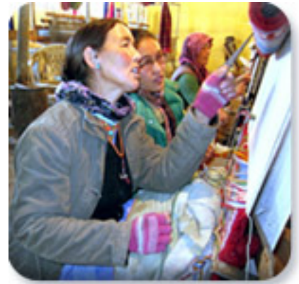
RZ Society supports vocational training ...