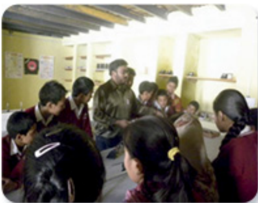
Science in action, our new laboratories at Munsel-ling.