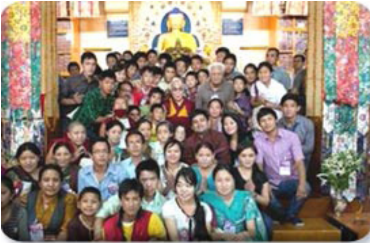
HH the Dalai Lama and the Himalayan Buddhist community.

His Holiness the Dalai Lama gave a three day introductory Buddhist teaching in Dharamsala especially for Himalayan Buddhists, i.e., aimed at Buddhists from regions of the Himalayas that are not part of Tibet, such as Spiti. Our students had a special opportunity to receive these teachings.