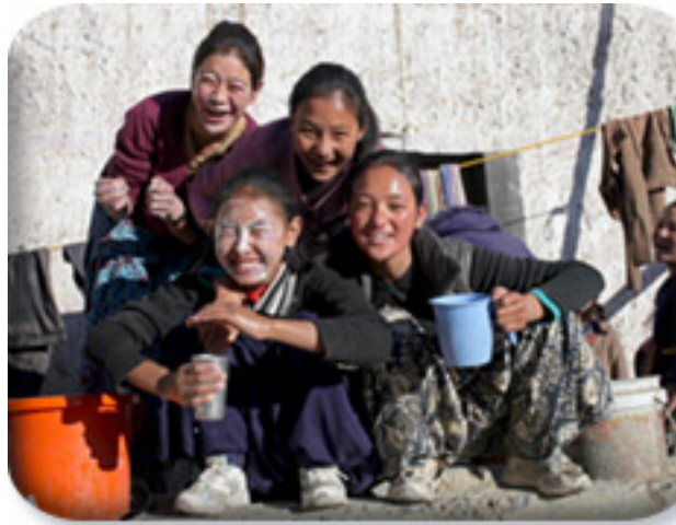
No shortage of soap at Munsel-ling.