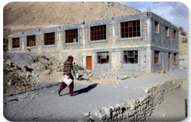
Fine dining facilities ... in Spiti-style.

For many years the dining facilities at Munsel-ling were cramped and substandard. This year we finished a large, new, properly built dining room. Many of our students are boarders who therefore eat three meals per day on site so the dining room needs a minimum standard of comfort. Wooden flooring would make the floor less cold and a lot less dusty for those sitting on it to eat.