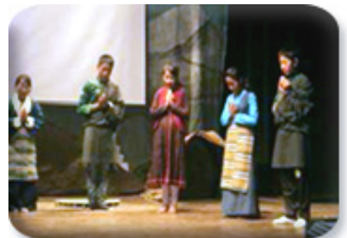
High drama at the Gaiety Theatre in Shimla.

To develop the mind, body and speech of students we held many quizzes, inter house competitions and sports events. We organized a social fair, an exhibition where children prepared models, charts and graphic displays covering all aspects of society, ancient and modern. The Performing Group of Arts, a theatre group from Simla, the Himachal Pradesh State capital, conducted a month long theatre workshop at Munsel-ling. The students' acting talents advanced very much during that time. They made a play from the story of a famous local Buddhist meditator and teacher of old, Rangrik Repa. They first performed it in the presence of Dzongsar Khyentse Rinpoche in Pin Valley. He was highly impressed and paid the expenses for the troupe to put on a much appreciated performance at the Gaiety Theatre, Simla, the oldest and best known of all theatres in Himachal Pradesh.