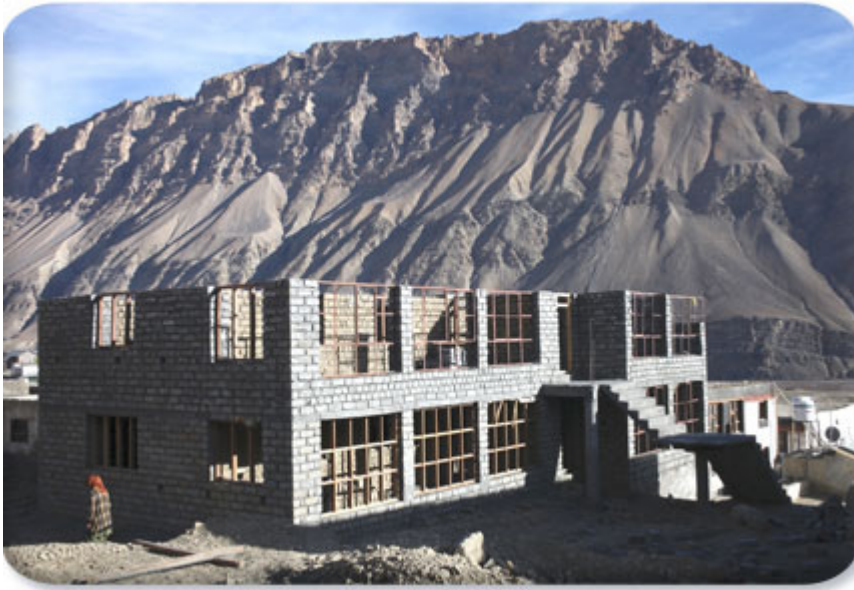
New girls' hostel, almost finished.