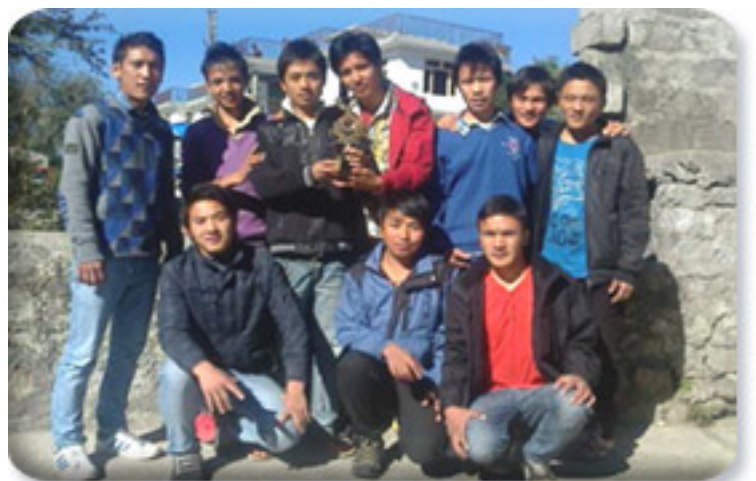
Team Rinchen Zangpo brings the cup home.

On 17th November we celebrated Spiti New Year with traditional singing and dancing and there were football and volleyball matches between three different Spiti hostels around Dharamsala. Our Sidbhari teams claimed victory. There was lots of fun and good food.