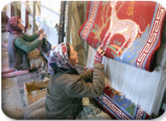
... here the manufacture of fine, hand-knotted woolen carpets.

Teachers Day we celebrated on 5th September. On this day in India students entertain their teachers with songs and dances and offer gifts and give thanks for the education they have received. Its counterpart, Children's Day we also celebrated.