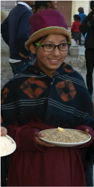
Indian independence marked at Kaza by Munsel-ling students

The Sidhbari hostel in Dharamsala held a grand celebration of the Spitian Losar with a multi-cultural programme attended by those from Spiti in and around Dharamshala as well as the local community.