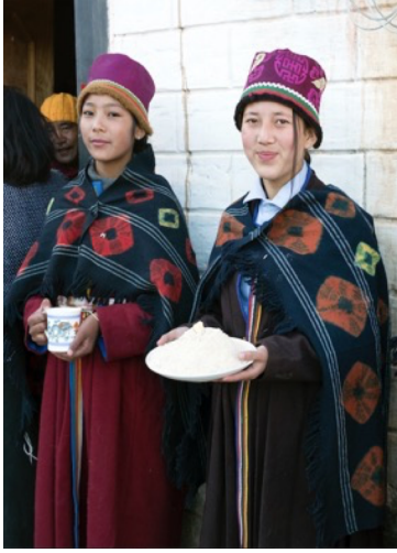
Spitian Losar celebrated in style at the Sidhbari hostel