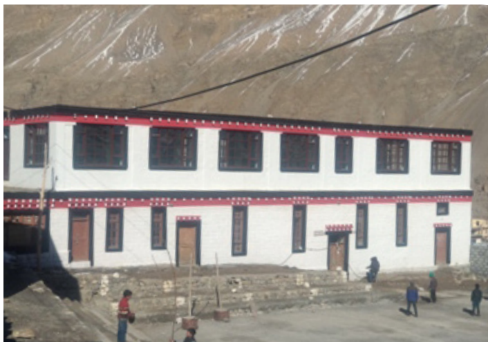
New examination hall at Munsel-ling.

Examination Hall: On top of the cultural hall there is now a newly finished and very spacious examination hall. Three hundred children can sit and take exams together! Funds to build this fine and useful addition to our infrastructure came from the local government.