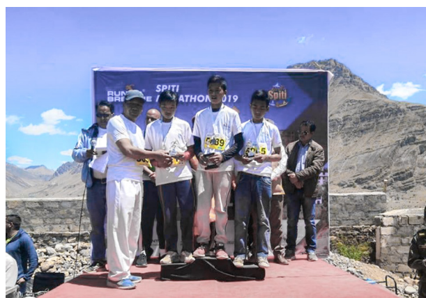
Contestants in the Run to Breathe marathon.

Run to Breathe: Run to Breathe was a marathon organized by the Tribal Development Department of the Govt. of Himachal Pradesh in collaboration with Rayon Company and All India Radio, Shimla. Our