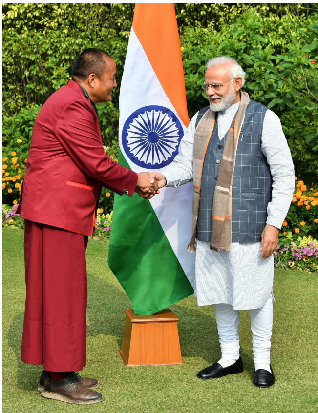
A community leader meets a nation's leader: Ven. Tashi Namgyal is congratulated by Indian Prime Minister Narendra Modi.

The event was telecast on national channels and shared widely on social media including tweets from the Prime Minister. All Rinchen Zangpo Society supporters can feel very pleased. It is always satisfying to back a winning horse!