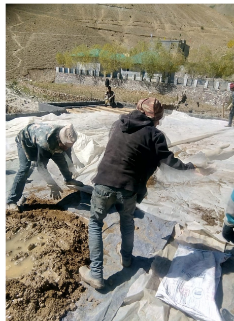
Workers applying a weatherproof layer to earthen roofs.