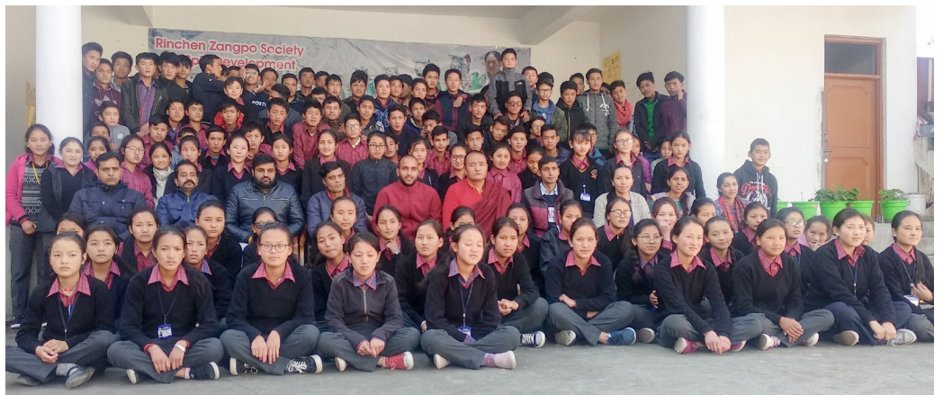
Students, staff and our precious teachers at Sidhbari Hostel during the winter session of classes.

The 8th, 9th and 10th classes from Munsel-ling School in Spiti left our home valley and shifted to our hostel at Sidhbari on winter migration in December as usual. At Sidhbari they experience the outside world and get extra tuition from skilled teachers instead of being stationed in their home villages in the cold with not much to do.