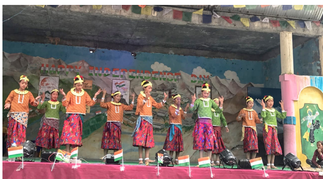
Indian Independence Day with traditional dancing at Munsel-ling.