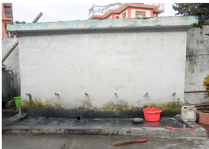
From GATE and Dr. Klauss we received a new water tank and washing station which are presently used many, many times a day.