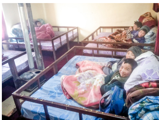
A warm and cozy night's sleep, courtesy of the Swiss government.

Roof Renovation: From 23rd September 2018 four days of very heavy rain hit Spiti. Traditional Spiti house roofs are flat and made of mud and earth laid over a wooden support of rafters, beams, then twigs or strips of wood. This is an ideal roof for a desert climate. Snow that falls in winter can be brushed off before it melts. Heavy rain is a serious threat.