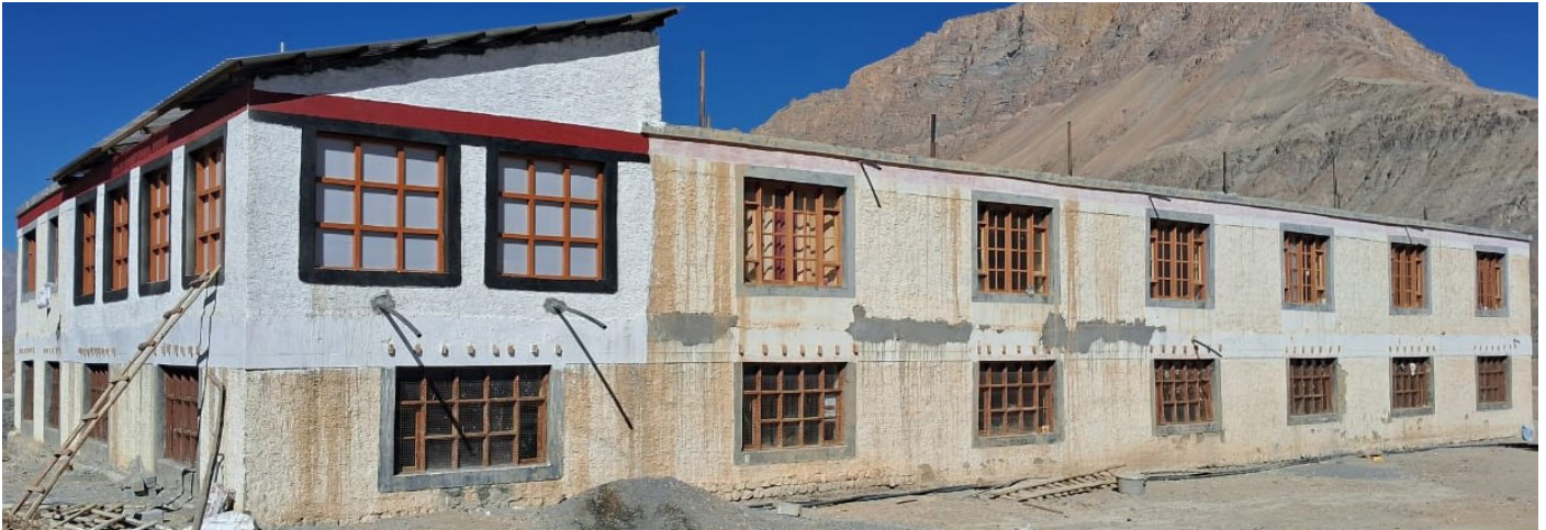
Our Rewa Buddhist Model School continues to be upgraded

The children of Rewa Buddhist Model School are now benefitting from an extension to their classroom block, a study space which admits as much sunlight as possible and thereby gives a warm place to work in the daytime. While higher altitude air can be thin and chill, lower latitude sunshine can be powerful in that thin air. Rewa is the school where most running costs and improvements are funded by Tibethilfe Niederösterreich (Austria). Our society is extremely grateful to them. ༄ེ