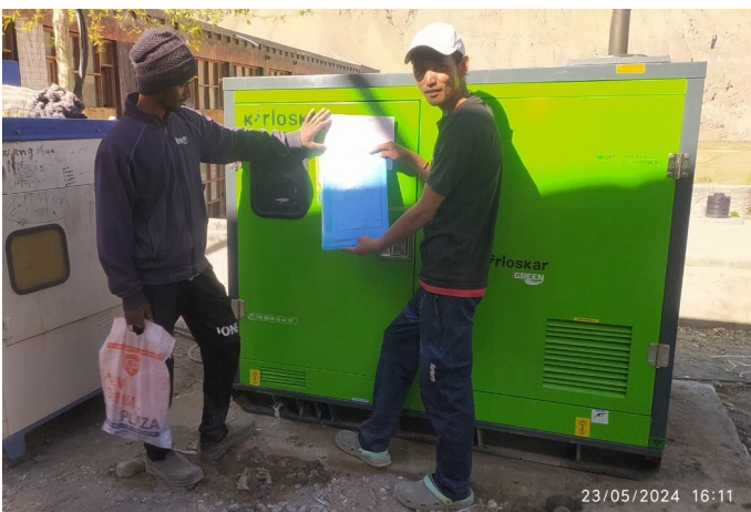
Our new electrical generator in operation at Munsel-ling