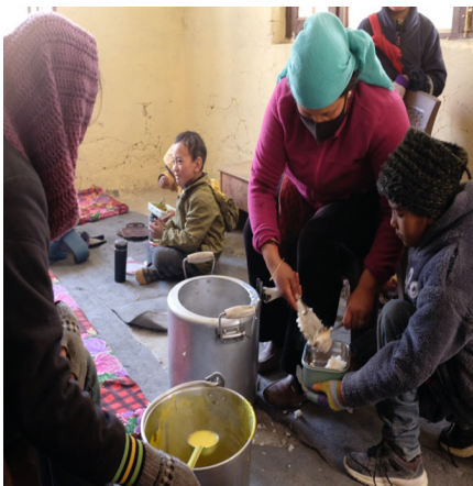
Clockwise from top left: 1) a wind gust makes a smokey stove; 2) prayer time; 3) torch light parade on Losar , Spiti New Year, 2nd December, 2024; 4) school dinner with rice and lentils. 🍴