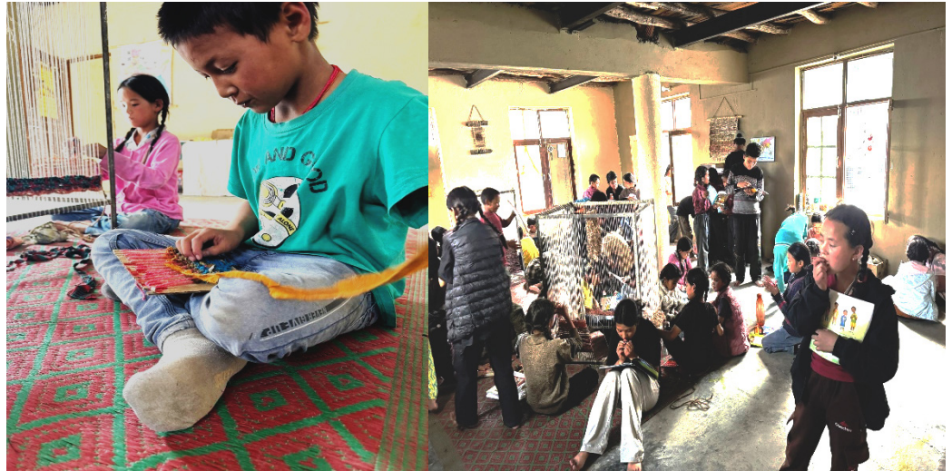
RECYCLING WORKSHOP with Argentinian volunteers