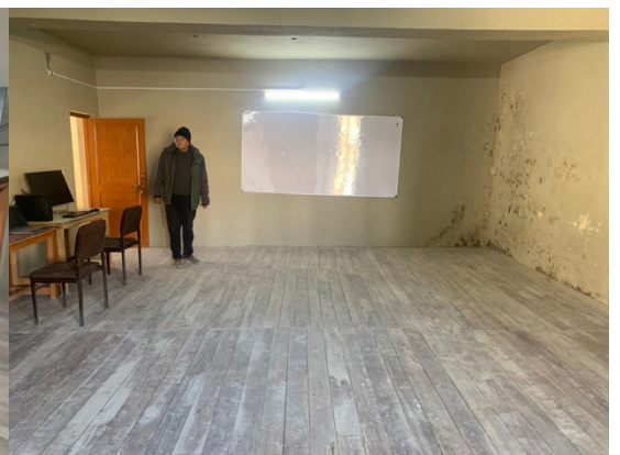
A high quality wooden floor graces our new digital classroom