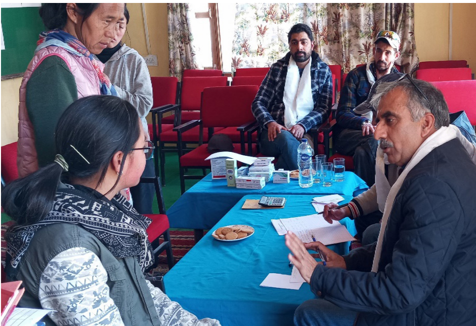
A TEAM OF DOCTORS from the Indhira Gandhi Medical College, Simla, paid a summer visit to perform medical check-ups for staff and children