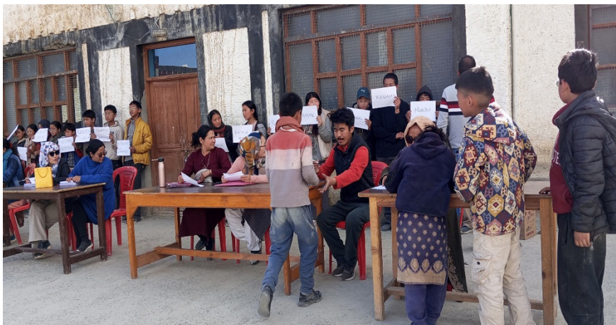
ELECTIONS AT MUNSEL-LING SCHOOL Head boy, head girl and class representatives all elected by the pupils