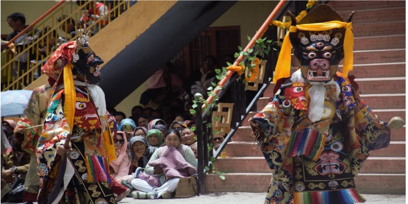
Monks wearing masks and silk brocade visualise themselves as dieties and protectors while performing a ritual dance ( cham )

Students from Munsel-ling School visited Kee Monastery to witness and celebrate the traditional Gutor festival — a colourful ritual that marks purification, protection, and the welcoming of positive energies.