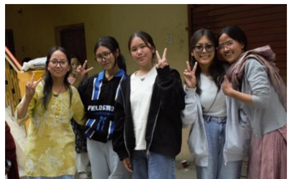
Students from Munsel-ling at the festival

In the timeless spiritual atmosphere of the monastery, our students learned about the significance of Gutor, enacted by the monks, in keeping with a tradition that has been maintained in Spiti for centuries, a chance for them to experience the richness and sophistication of their own local, high Himalayan culture.