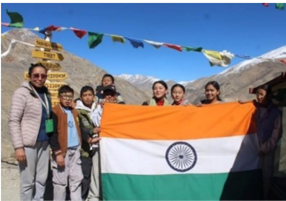
Unfurling the tri-colors on the Indian side

Classes VIII and IX visited Lepcha, not far from Sumdo, one of the few places in Spiti where one can easily touch its long mountainous border with Tibet, and so a good place for a photo-opportunity! The milestone in Hindi says, “Tibet 0 km”.