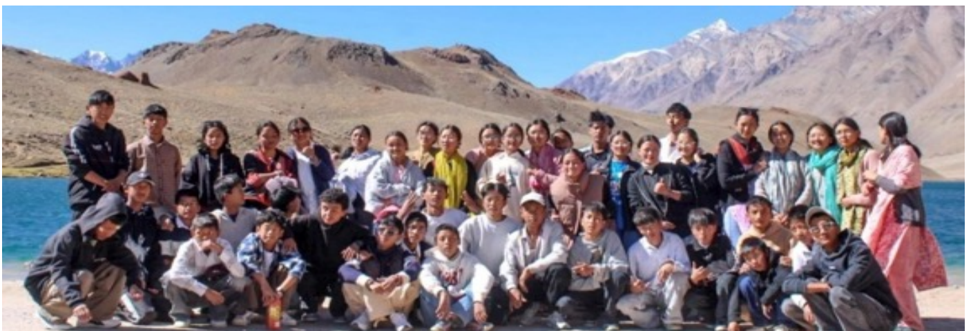
Students enjoy the sun on the shores of 'moon lake', the glorious Chandra Thal