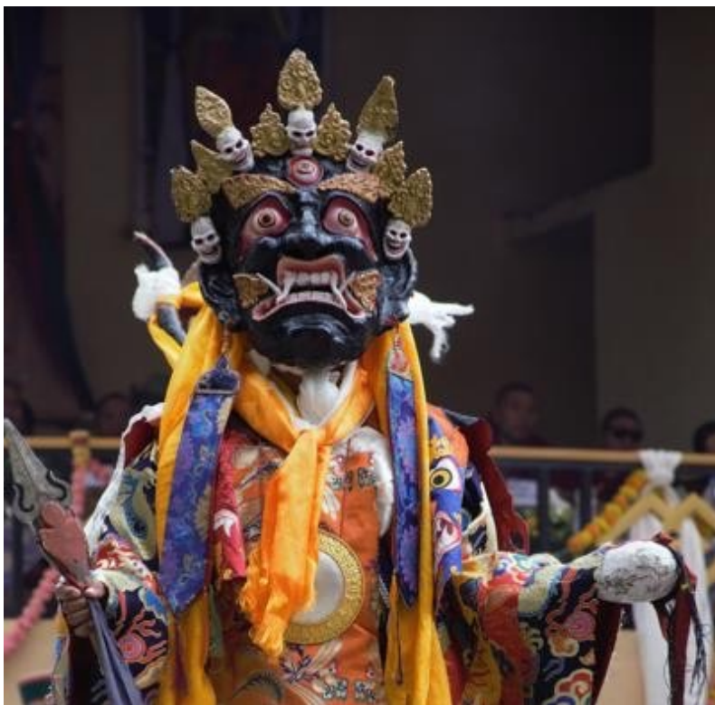
A monk in costume holding symbolic weapons and implements

Students from Munsel-ling School visited Kee Monastery to witness and celebrate the traditional Gutor festival — a colourful ritual that marks purification, protection, and the welcoming of positive energies.